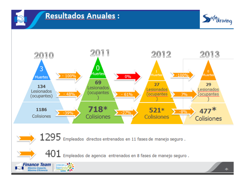
Figure 6 – Nestlé Mexico reductions in fatal, injury and minor collisions