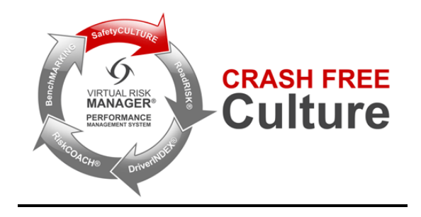
Figure 2 – The VRM 'crash free culture' process

In the UK and Ireland the Virtual Risk Manager (VRM) launch has engaged almost 4,000 people in road safety across 25 diverse sites and business areas, including truck, company car, cash for car and occasional drivers. The program has focused on engagement and risk visibility across a diverse and decentralised workforce. As well as following the model shown in Figure 2 the program has also focused on identifying all exposure levels, on utilising government driver licence records for compliance and risk management, and integrating collision and face to face training records into the system. All drivers are being coached using online materials covering topics such as Attitude, Speed and Bad Weather in the run up to winter. The most at-risk drivers are also being engaged based on their exposure levels, risk assessment outcomes, collisions and any penalty points showing on their licence. Management training is being piloted and undertaken to allow first line managers to engage with their teams.